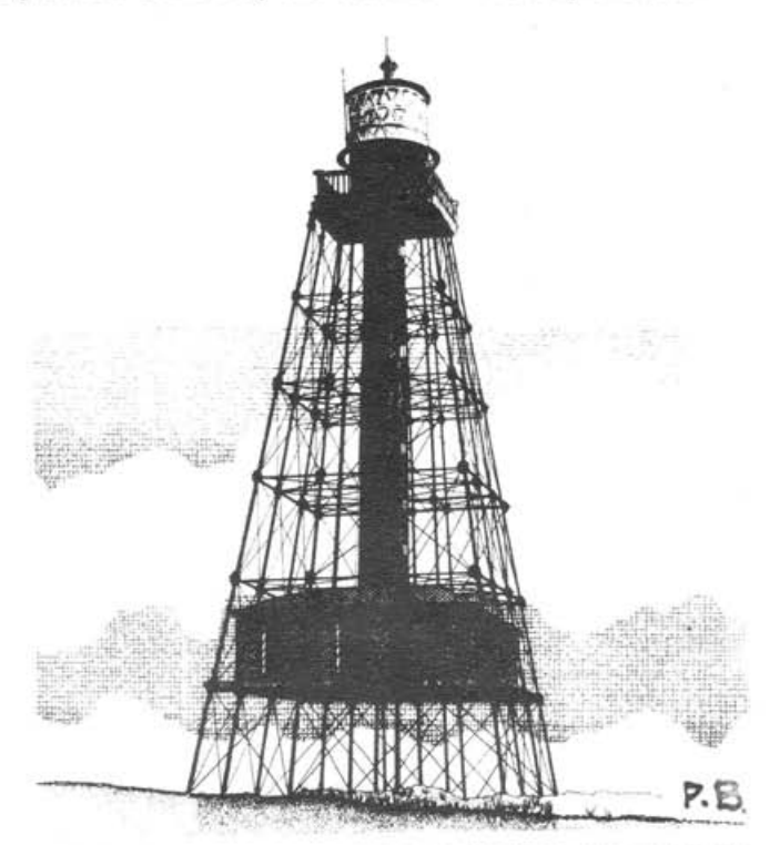
1853 SAND KEY LIGHTHOUSE

A chain of six iron "screw-pile" lighthouses were built on the offshore reefs from Miami down the Florida Keys, with Sand Key the southernmost Lighthouse.