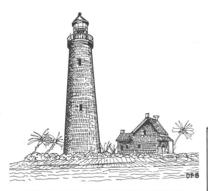
1827 SAND KEY LIGHTHOUSE