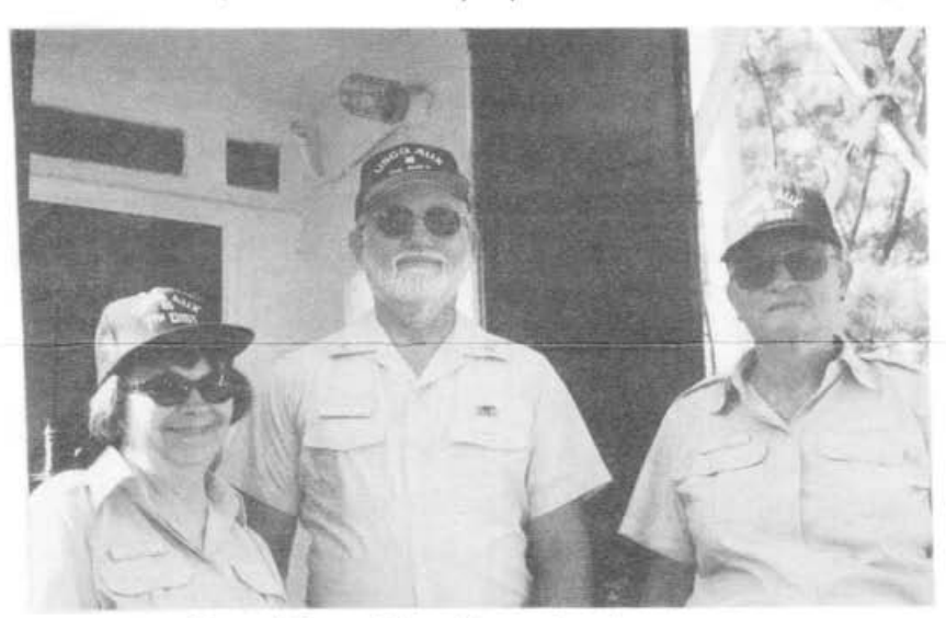
Coast Guard Auxiliary at entrance

AQUA VIEW, a 20 minute trip up the scenic Intracoastal, under bridges and through Hillsboro Harbor,