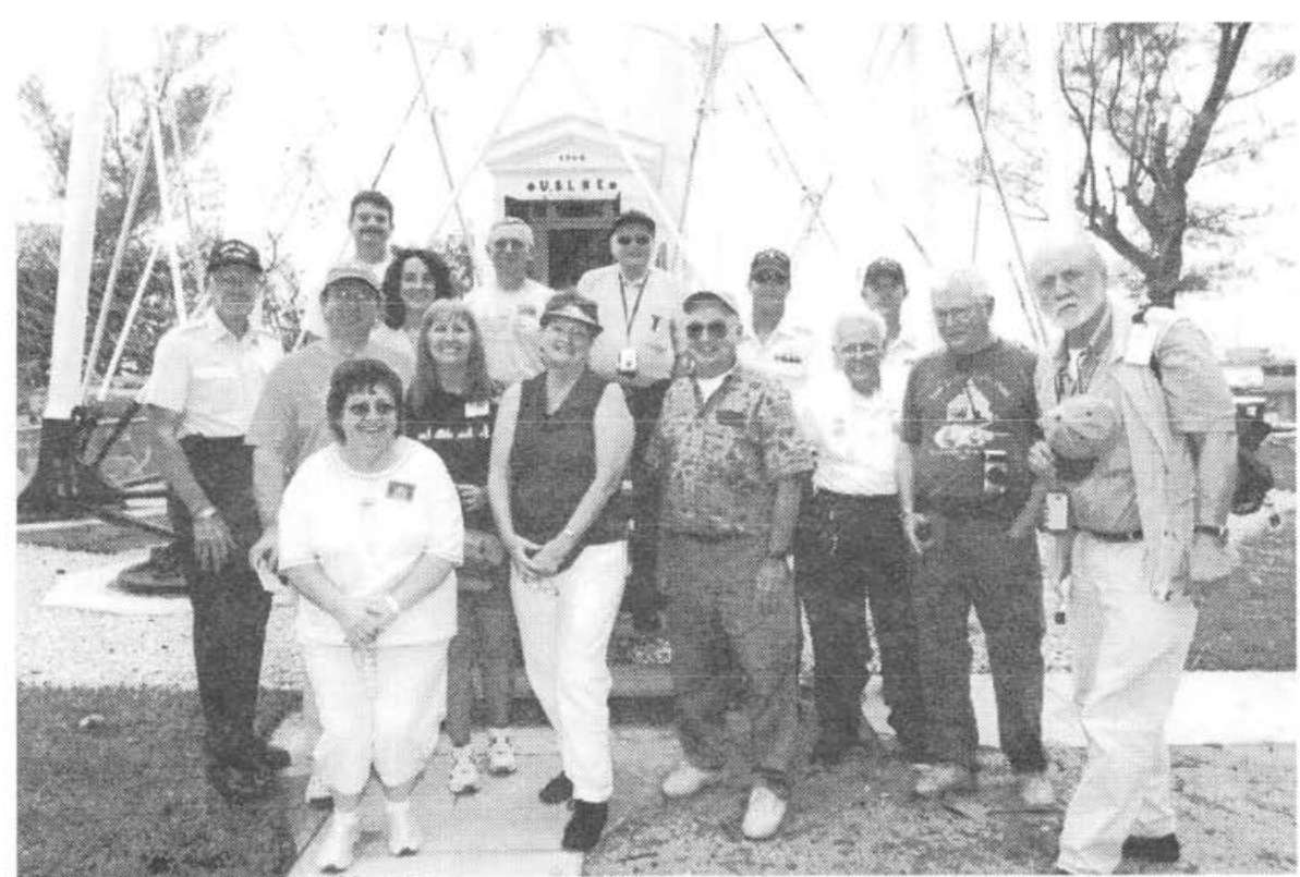
Some of the U.S. Lighthouse Society members who toured Florida's east coast lights stopped at Hillsboro Inlet February 21, 2005