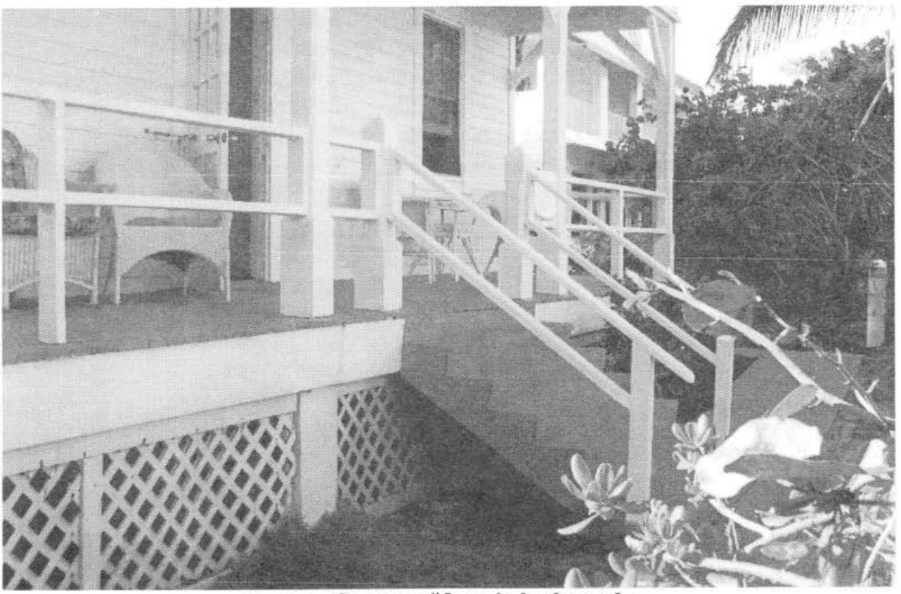
Keeper Cottage #3 as it looks today.

Whatever the outcome, be assured that Hillsboro Lighthouse Preservation Society is working diligently and with help of Broward County Historical Commission, Broward Trust for Historic Preservation, and other groups to save this building so school children, local adults, and visitors alike can visit and absorb some of our County's early history. It would be a "win-win" situation for all and a reason for great celebration at our Lighthouse Centennial next year.