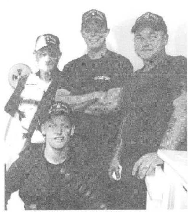
The ANT Team in Machine Room