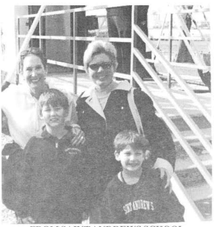
FROM SAINT ANDREWS SCHOOL