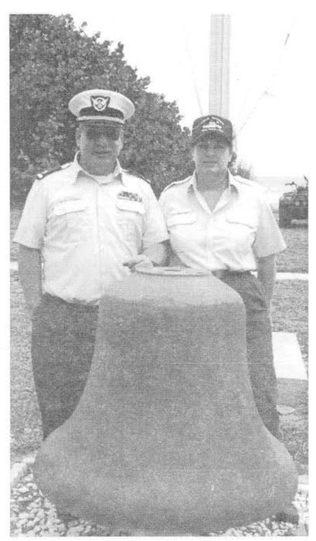
The EDELMANs CGAux.