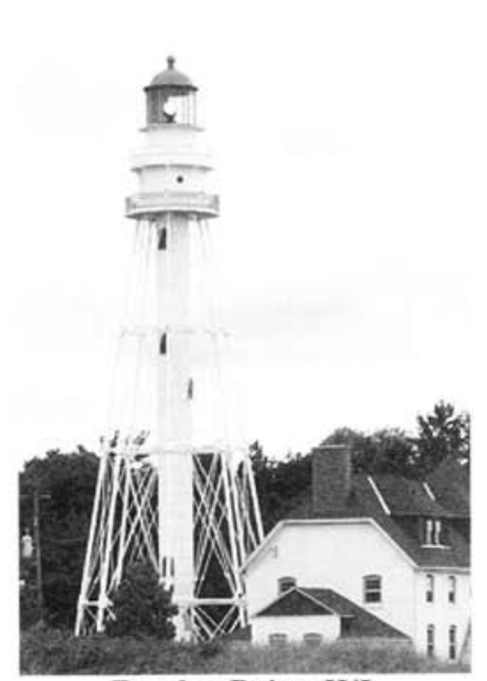
Rawley Point, WI