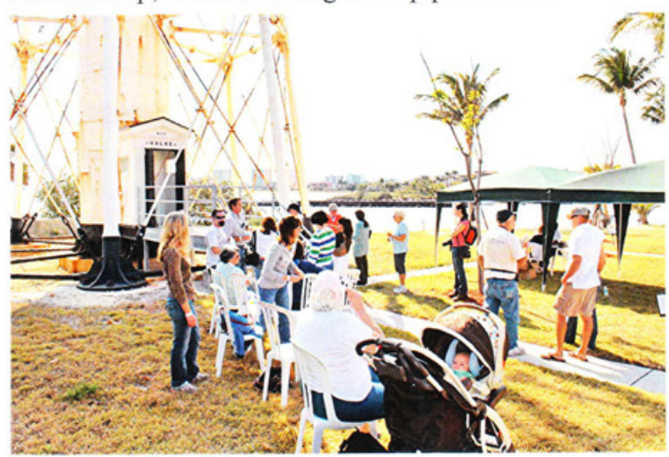
Waiting to climb the Lighthouse Tower

the HLPS tables to check in and receive a wrist band to board the chartered 49 passenger boat that will shuttle to and from the Light Station beginning at 9:00 AM with the last trip to the Lighthouse at approximately 2:45 PM. The Lighthouse Station closes at about 4:30 PM and all remaining guests will return to the Sands Harbor Hotel at that time. Volunteers will be available to answer questions you may have and Coast Guard Auxiliary members will be stationed at the tower door to usher you inside where you can view the unique staircase, each tread having a Roman Numeral number. If you are not able to climb up to the top, go up a few steps to the first window for a better view. A trip to the top gives you a chance to go out on the observation deck for a spectacular view of Broward County. On a clear day you can see Port Everglades to the South, Boca Raton Inlet to the North and tall buildings as far West as Coral Springs. ---- Checks or cash only for membership, renewals and gift shop purchases.