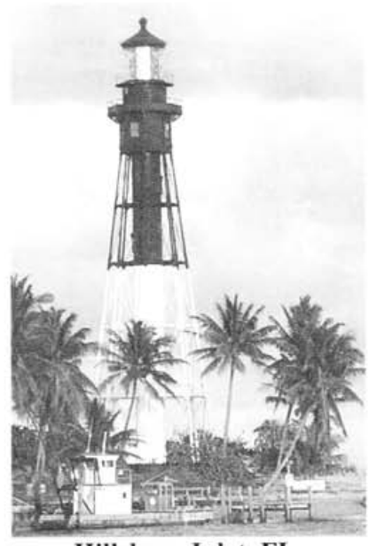
Hillsboro Inlet, FL