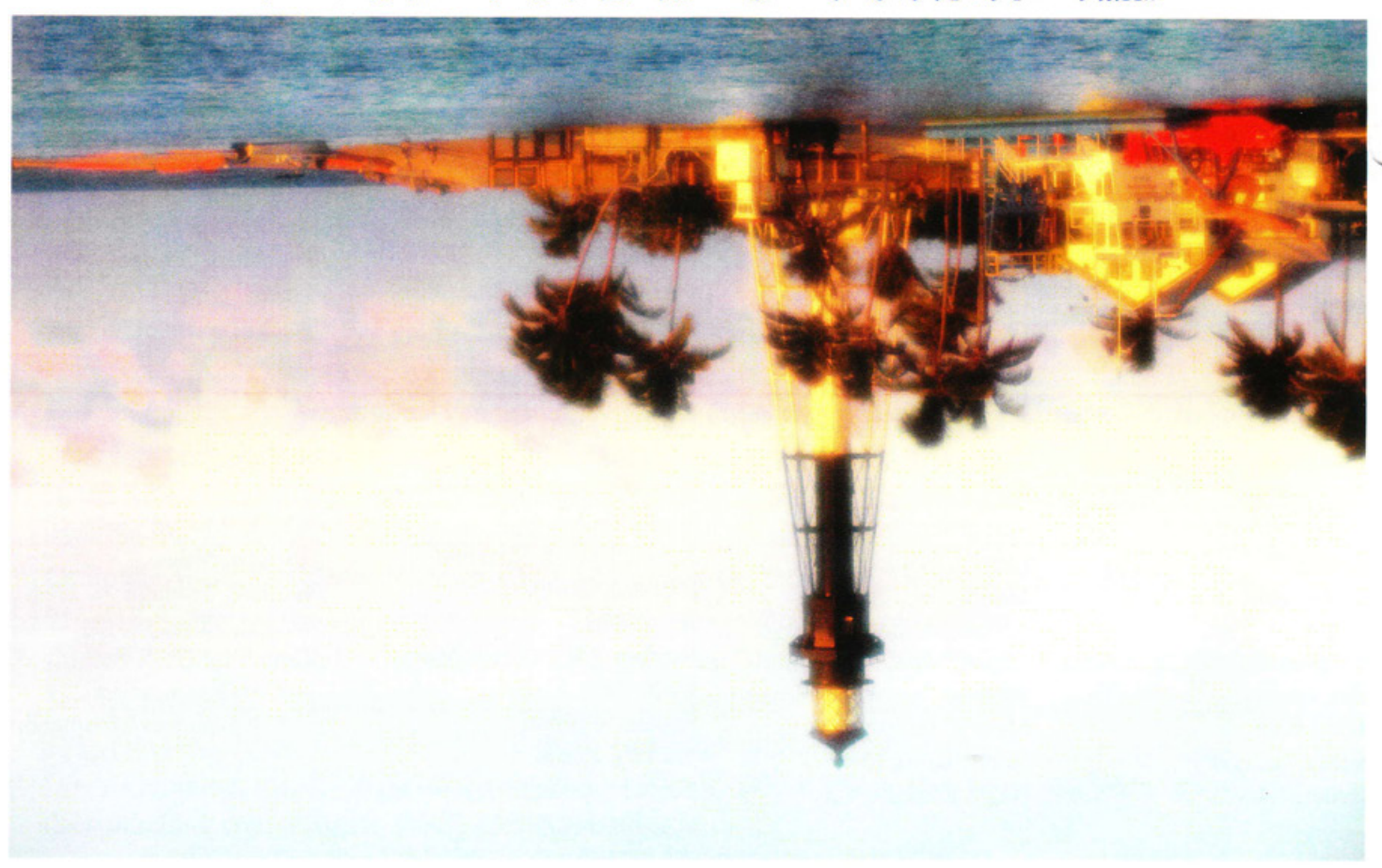
"Hillsboro Inlet Light Station at Sunset" by Clark Gambarrotti, Photographer.

Hillsboro Lighthouse Preservation Society, Inc. (New) P. O. Box 610326, Pompano Beach, FL 33061-0326