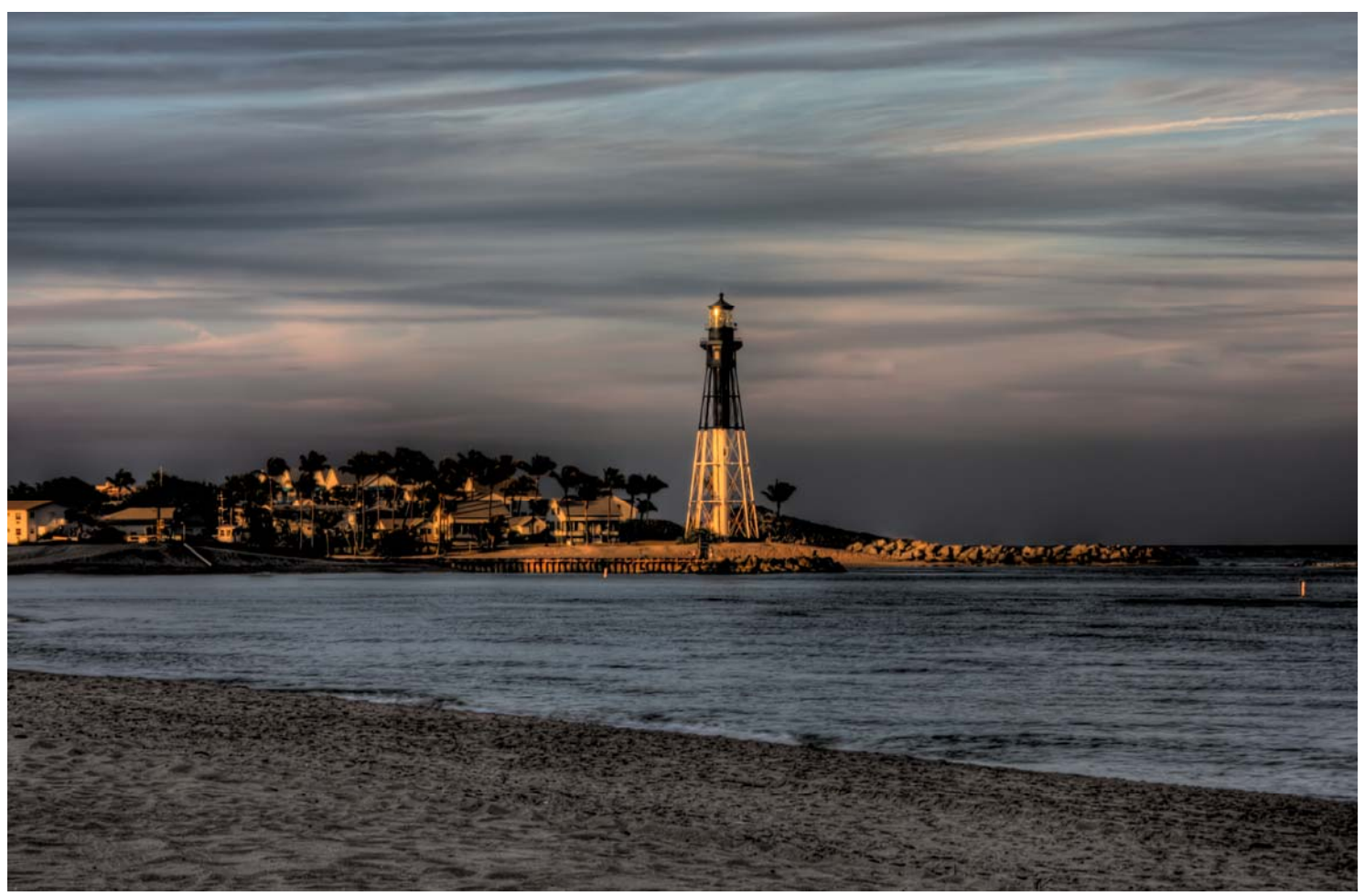
"Twilight Beacon" by Susan Caplan of Pompano Beach, FL http://photosbysusan.aminus3.com/

Hillsboro Lighthouse Preservation Society, Inc. P. O. Box 610326 Pompano Beach, FL 33061-0326