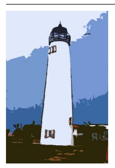
St. George Light