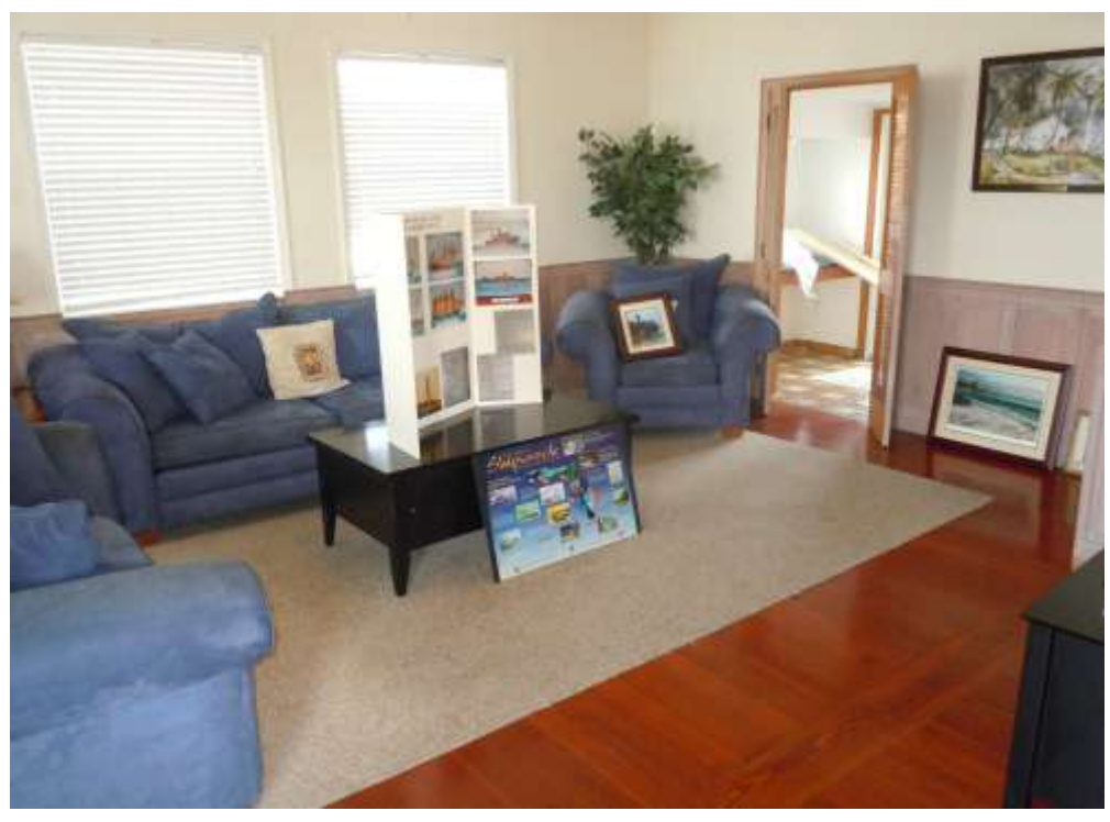
HLPS Museum in the Assistant Keeper's Cottage

HLPS' effort to preserve the Hillsboro Inlet Light Station has benefited from the support of the community, and the interest in the cottages never wanes.