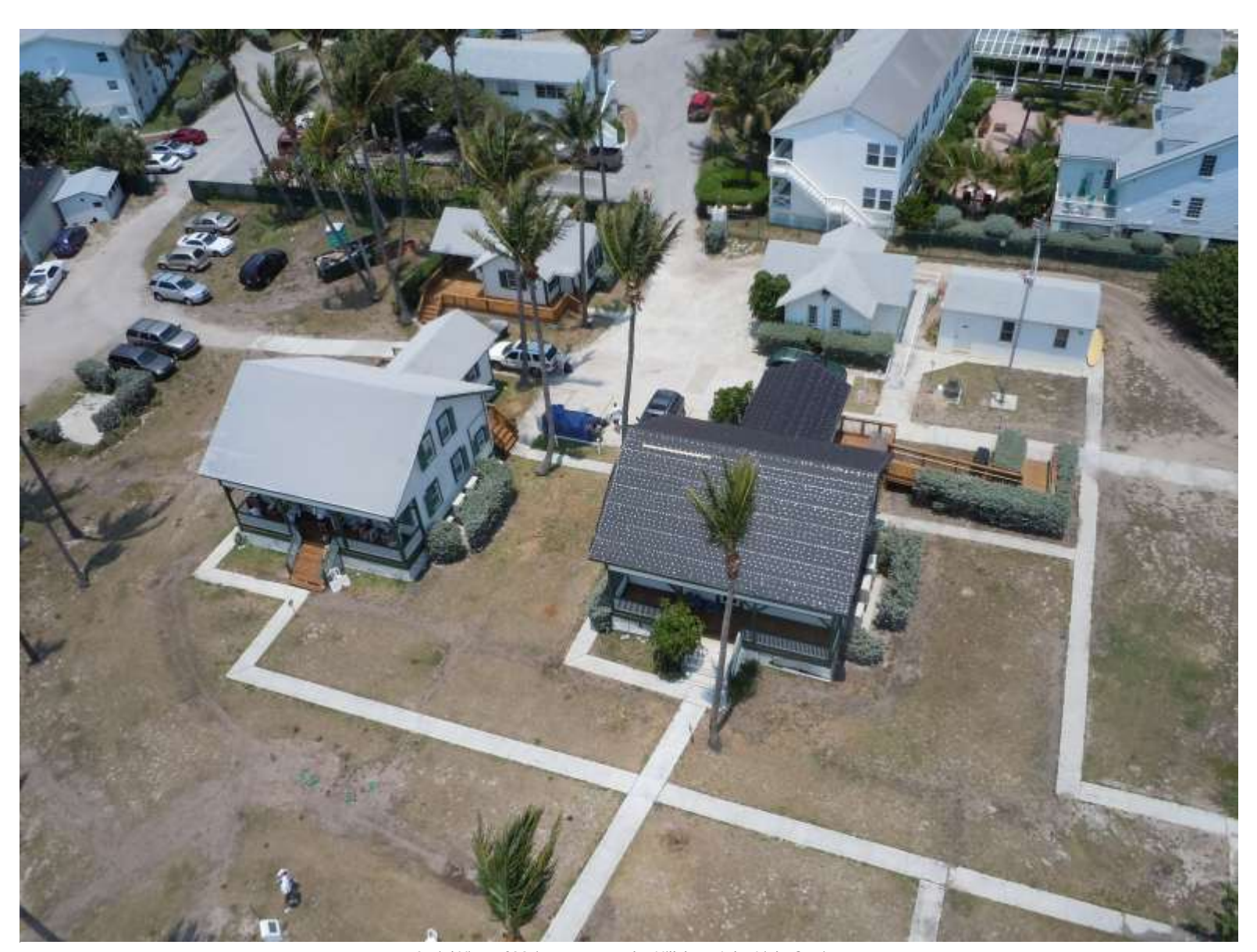
Aerial View of Maintenance at the Hillsboro Inlet Light Station

In addition, plumbing for the Light Station's new automatic sprinkler system had been installed. After completion of the sprinklers, it is expected that the property will have its sea grapes removed, new sod, shrubs and palm trees planted, and finally a new property gate installed. •