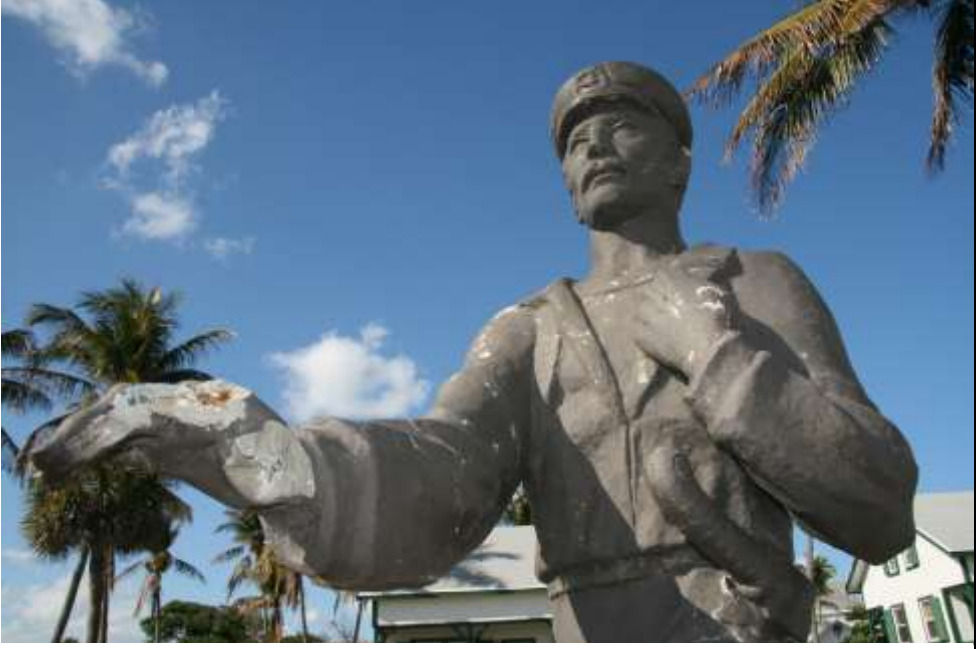
The damaged Barefoot Mailman statue at Hillsboro Inlet Light Station

nearly irreparable damage to the monument.