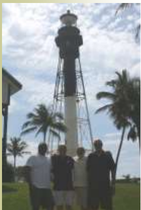
See Page 6