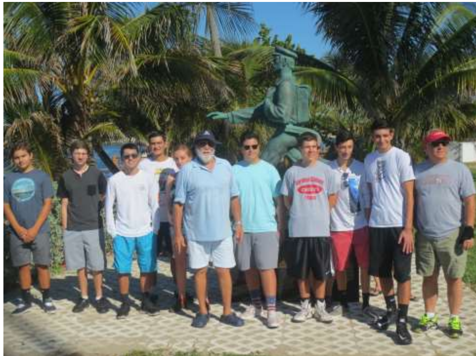
Cardinal Gibbons Students at Hillsboro Lighthouse