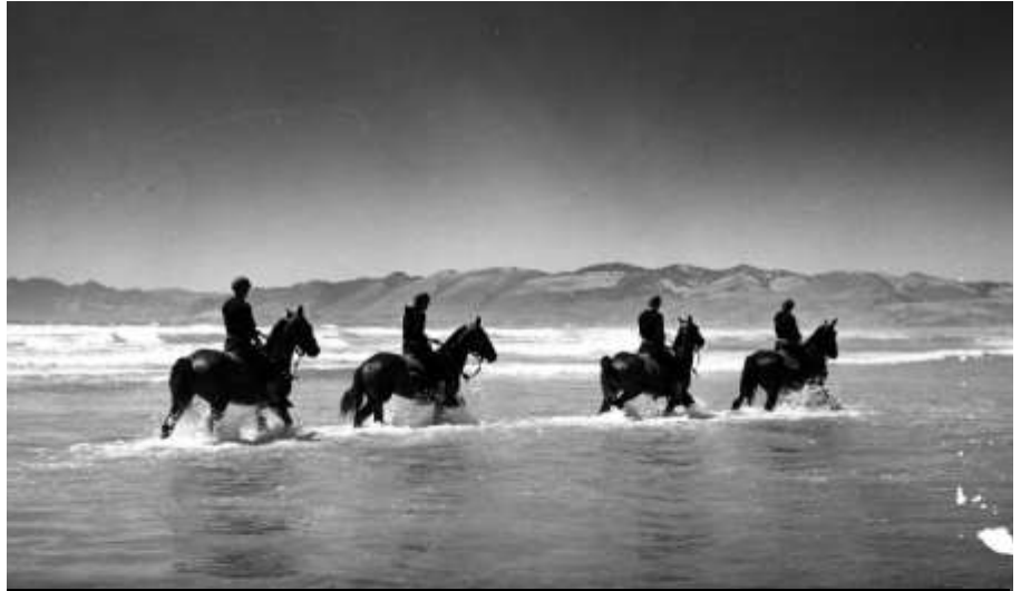
Beach Patrol 1942

The work of beach patrol either on foot, in vehicles or horseback – could be hard but they were a strong group of men, highly motivated to do their part for the war effort.