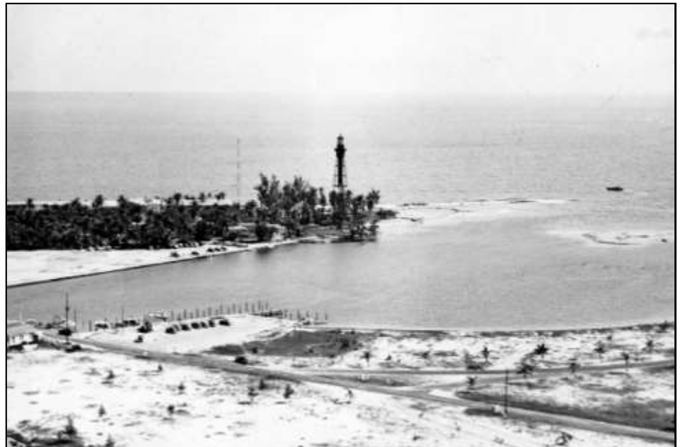
Inlet shores 1942

on Hillsboro Shore reefs, and the crew was captured by the Navy and the Coast Guard residing at the lighthouse. Also another story was that the German U-Boat Crew was captured while attempting to kidnap Sir Anthony Eden then The British Foreign Secretary visiting Hillsboro Beach. Eventually, by early 1944, all German war vessels were sunk and destroyed by the U.S. Army Air Force and the U.S. Navy. Only few managed to sail back to European shores.