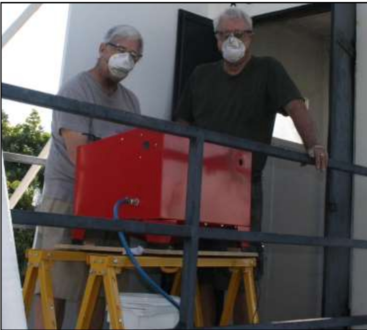
Grit blasting bronze components

The first glass pane was removed and replaced on the 20 th of January 2015. While planning for this project HLPS advised the Coast Guard Aids to Navigation office that the nightly light operation would not be interrupted during the entire project. The glass panes had to be removed after dawn and installed before dusk. The classic lens had to be protected during the entire working hours in the lantern room. HLPS