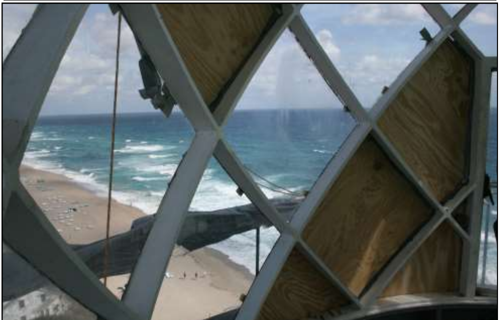
Glazing project in progress