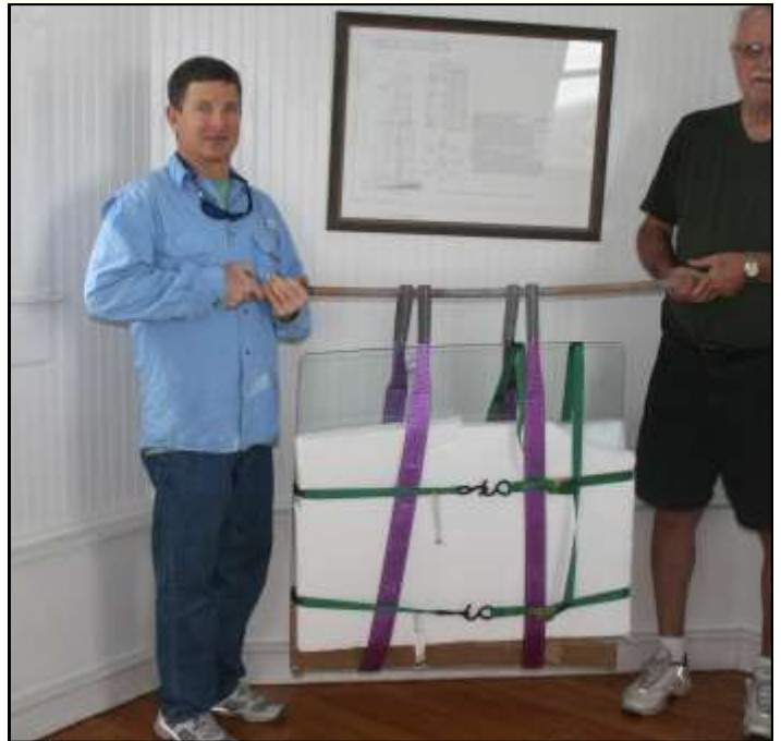
First glass pane 5-16 thick, 32.5X32.5 , 30lbs

volunteers did just that. The last glass pane was installed on the 29 th of April 2015, a full month ahead of schedule.