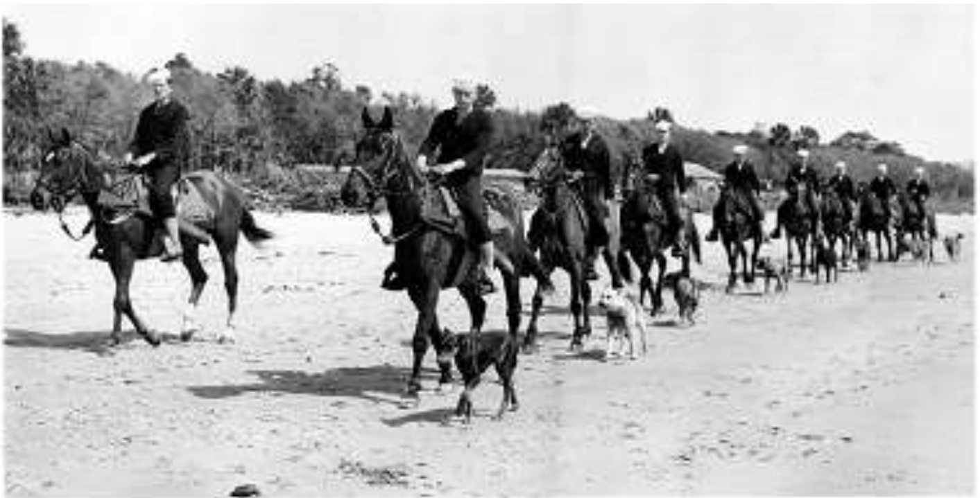
Beach Patrol 1943

The Coast Guard never used mounted patrols again, but this unusual part of the service's history illustrates its unending flexibility and adaptability, and is a shining example of how the Coast Guard continuously lives up to its motto.